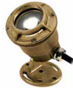
LS275LED Star II