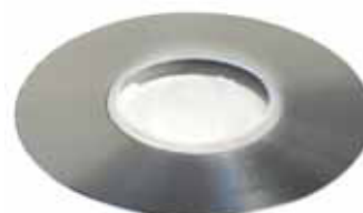
LS9401LED & LS9403LED Vedita